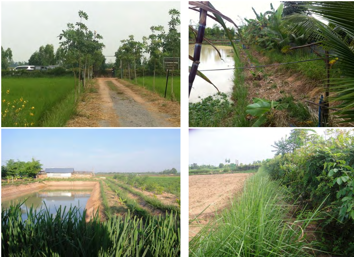
Figure 5 The learning center after start project

At the same time, this learning centers also the agro-tourism for student, farmers, Governments and Organizations for publicizing the knowledge of vetiver and promotion of the knowledge on sufficient economy.