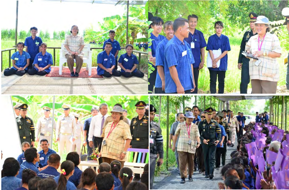
Figure 7 Her Royal Highness Princess Maha Chakri Sirindhorn visited here and her was met the farmers that produce royal organic rice on 27 October 2014