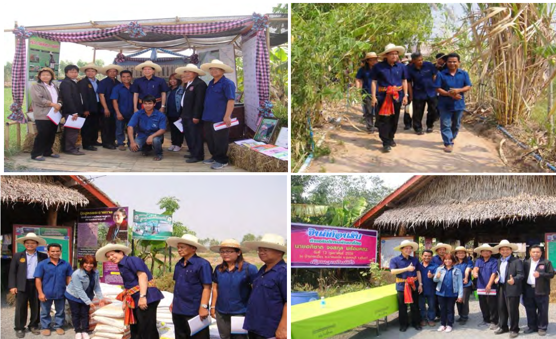
Figure 8 Director of Land Development Department visited here and materials delivered in the production of organic fertilizers to member of farmers this here on 13 February 2015