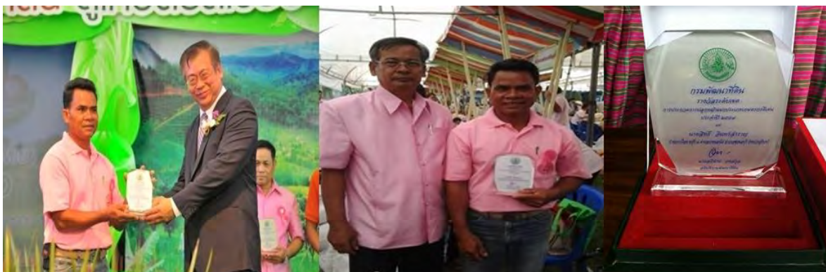
Figure 6 This learning center have been Regional Awards "Contest of Vetiver grass cultivation excellent" organized by Land Development Department on 2014

At the same time, this learning centers also the agro-tourism for student, farmers, Governments and Organizations for publicizing the knowledge of vetiver and promotion of the knowledge on sufficient economy.