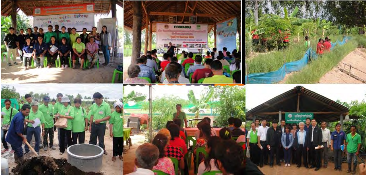
Figure 9 Training and knowledge sharing for students, farmers, Governments and Organizations visited this here

Presently many students and farmer in the nearby areas have arranged study tours and visits to the learning center in order to inquire and request for support of vetiver tillers of various ecotype. In this regards, the learning center has responded to the visitors request as best as they can.