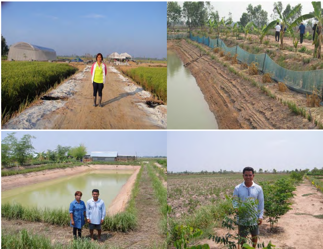
Figure 4 the learning center before start project

The farmer has been workshop by Land Development Department in order to conduct experiments on the benefit of planting vetiver grass. It was appeared that the vetiver grass can be preventing soil erosion. It maintains soil moisture and can be grown in infertile. In addition, the farmer want to be extended to member in the village or other people in the nearby areas for serving as an extension center to supply vetiver tillers for soil and water conservation in order that covering Nanongphai sub-district area.