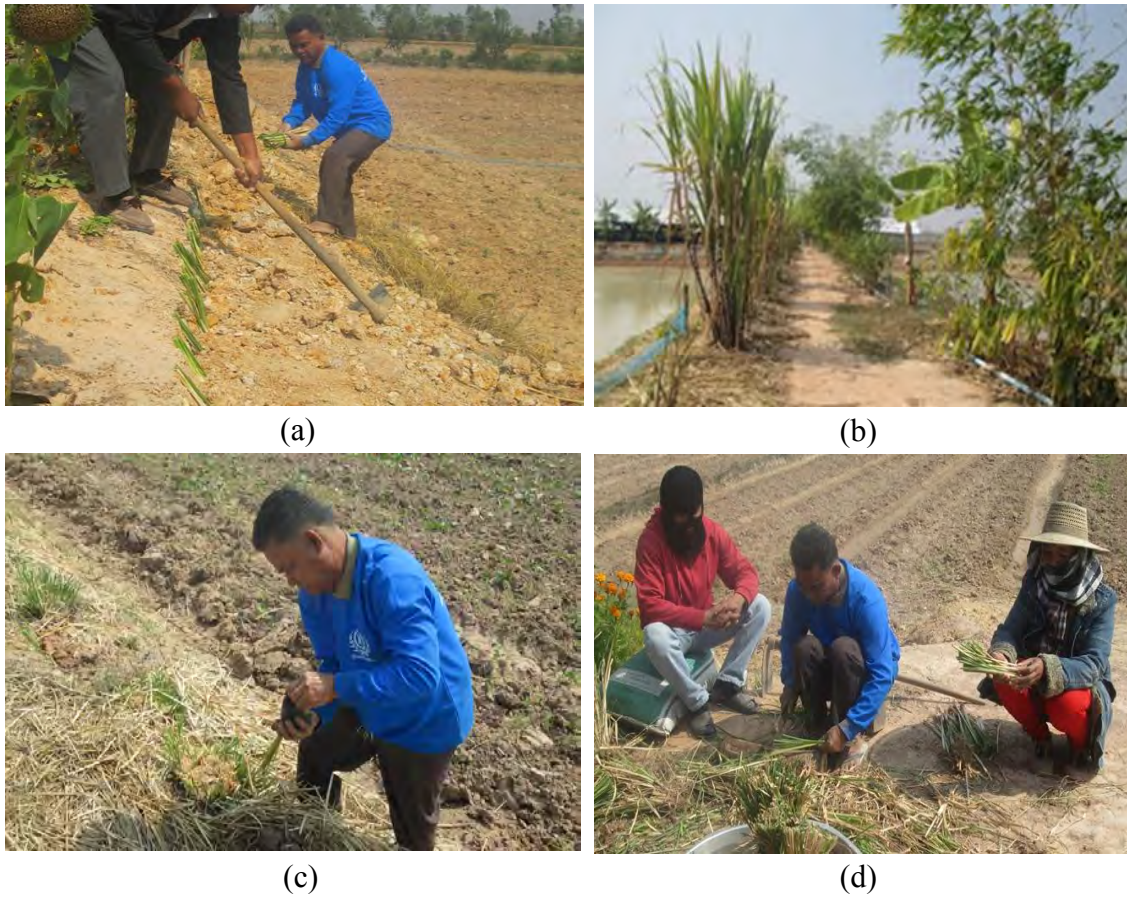
Figure 2 Patterns of vetiver grass learning center

residue such as palm bunches, sawdust which consist of hardly decompose component namely cellulose, lipid and lignin to decrease decomposition time for making the compost), molasses and manure were composted (Figure 3).